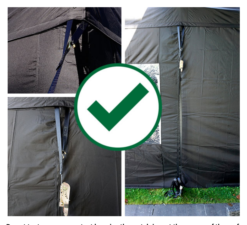
Do not try to secure your tent by using the metal rings at the corners of the roof cover: